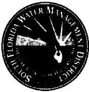
Exhibit "D" Siena Reserve

South Florida Water Management District Individual Environmental Resource Permit No. 49-100288-P Date Issued: May 30, 2018